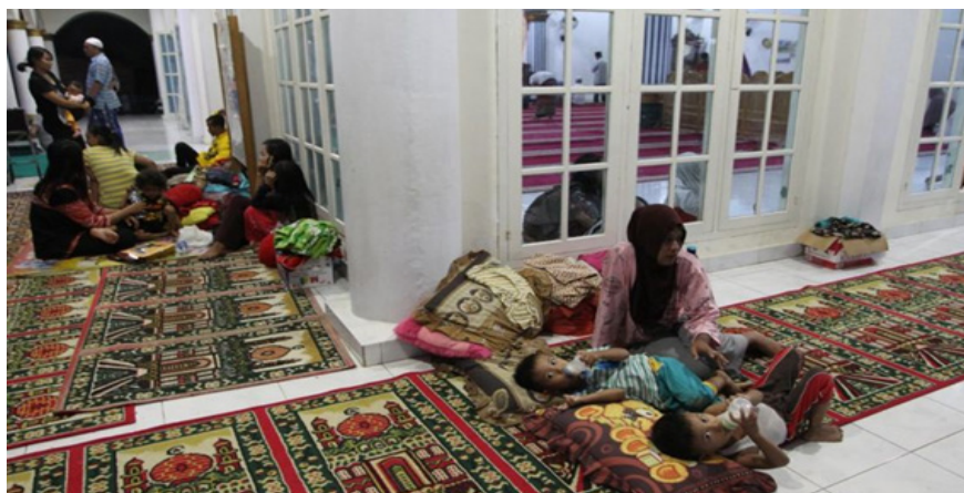
FIGURE 3. The refugees stay at the mosque.

among the mosque administrators because it is not a place for refugees, and they may misbehave later in the mosque. The flood occurs because God is angry with human behavior. Do you want to add to it by polluting the mosque?