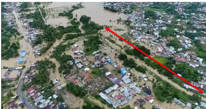
FIGURE 2. Serut river overflows the resident area.

The findings for the first purpose of revealing the perception of mosque administrators towards mosques as emergency shelters were analysed through a series of observations, documentation, and in-depth interview. It rained for 14 hours in all areas of Bengkulu City on 26 - 27 April 2019; from 01.30 p.m. to 03.00 a.m. Rain with moderate to high intensity submerged the city in 28 locations. The flood was the worst one in the last 30 years. Based on our analysis, there were four leading causes of the flood: there was a land alteration around the headwater streams of Serut River, there was narrowing and silting of the river, the road level was higher than the house level, and the region was partly a swamp area. Figure 2 shows the flow of the Serut River that failed to accommodate the water volume that finally flooded the residents' housing.