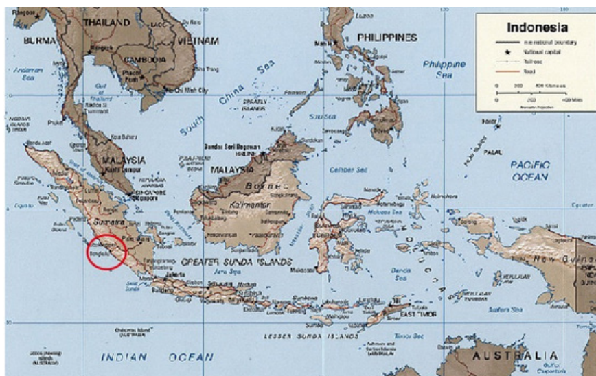
FIGURE 1. Map of Indonesia Indicating the Location of Bengkulu.