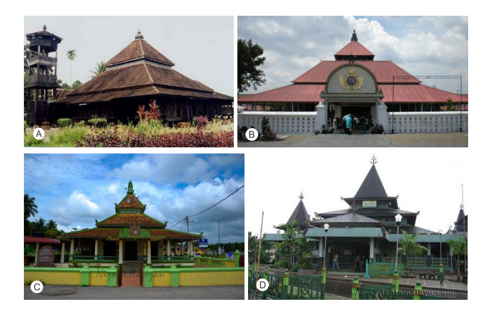
Figure 4 . A. Kampung Laut mosque; B. Kauman great mosque; C. Air Barok village mosque; D. Sultan Suriansyah mosque.

As the earliest mosque, Demak mosque has been the template for mosques in the Malay world, at least until the nineteenth century. This influence was possible through the relation between Demak Kingdom and other Kingdoms in the region, and the relation between the walis and their students and communities in the area. Several mosques following the prototype of Demak mosque, at least in its spatial design, are: Kampung Laut mosque in Malaka,<sup>21</sup> Sultan Suriansyah mosque in Banjar, Borneo (early sixteenth century), the Great Mosque of Mataram Kingdom (1773), Air Barok Village Mosque in Malaka (1916).<sup>22</sup> In much later period, Soeharto, the expresident of Indonesia, promoted replicas of Demak mosque in a standardized form to be used nationwide.<sup>23</sup>