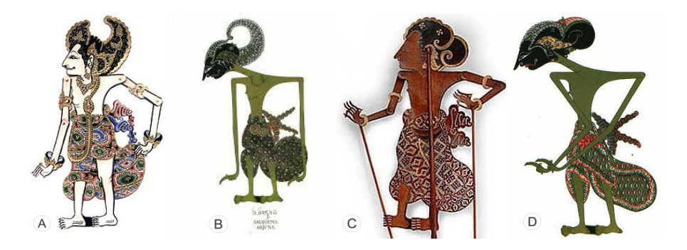
Figure 6 . A. Balinese puppet depicted the figure of Arjuna. This puppet shows an older shape for wayang puppet; B. The stylization of Arjuna in Javanese puppet; C. Balinese puppet for Yudhistira; D. Javanese puppet for Yudhistira.

Another Islamic influence on wayang is portrayed in the attempt of the walis to create non-realistic puppets to follow religious prescription restricting the portrayal of the living and breathing creatures.<sup>29</sup> Stylization of the puppets was similar to the context of Islamic figurative art in Persia.<sup>30</sup> There is no report where the walis received the idea from. It seems that the idea of denaturalizing the creature popular in that period could easily reach the walis .