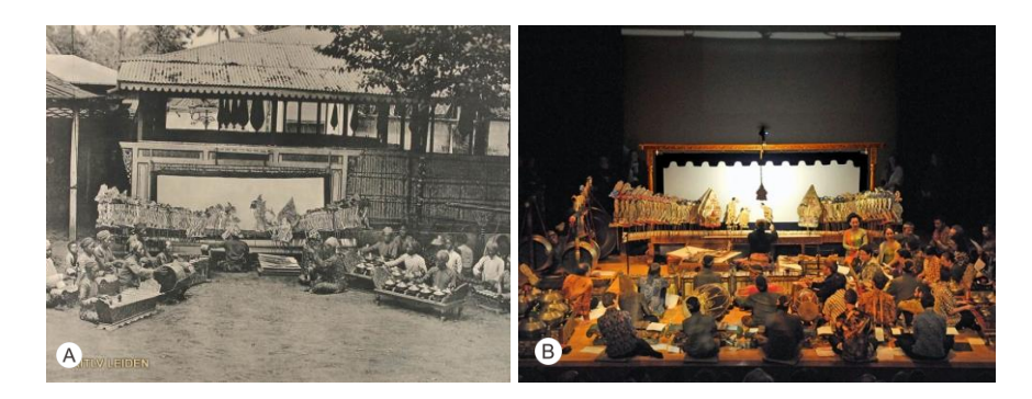
Figure 5. The puppet shadow play.

Another Islamic influence on wayang is portrayed in the attempt of the walis to create non-realistic puppets to follow religious prescription restricting the portrayal of the living and breathing creatures.<sup>29</sup> Stylization of the puppets was similar to the context of Islamic figurative art in Persia.<sup>30</sup> There is no report where the walis received the idea from. It seems that the idea of denaturalizing the creature popular in that period could easily reach the walis .