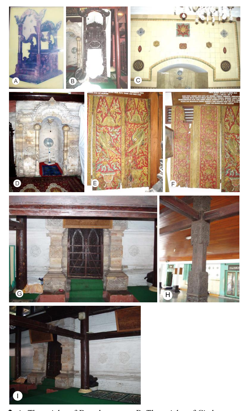
Figure 2 . A. The minbar of Demak mosque; B. The minbar of Cirebon mosque; C. The mih\bar{n}ab of Demak mosque (The tiles are later renovation); D. The mih\bar{n}ab of Cirebon mosque; E. F. The door leaves of Demak mosque; G. The door of Cirebon mosque; H. Carved woods in Demak mosque; I. Carved woods in Cirebon mosque.