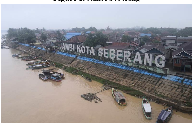
Figure 1. Jambi Seberang

is the primary market and the economic center of Jambi. The Opposite Area of Jambi City or Jambi Seberang describes the former Jambi City area before relocating to the south side of the Batanghari River. Here, the indigenous people of Jambi who adhere to the Arabic-Malay religious culture reside and flourish. Malay Arab culture results from a fusion of cultures introduced by Arab traders and native Malay people.