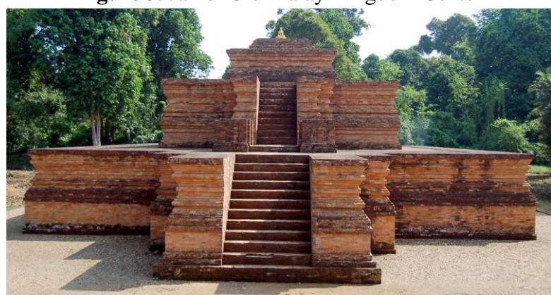
Figure 3. Jambi Old Malay Kingdom Center

Dhamasraya, Malayapura, and Pagaruyung. The Malacca Peninsula region dominates the crucial trade route on the East Coast that connects Persia, India, Gujarat, China, Arabia, and the Archipelago. The Malay kingdom became one of the kingdoms in Indonesia. The development of relations with the outside world has impacted the fields of economics, commerce, culture, and Islam.