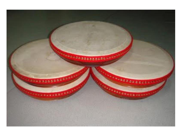
Figure 6. Kompang Musical Instrument from Jambi Seberang

In the province of Jambi, Kompangan art serves as a ritual, educational, entertainment or aesthetic facility, economic, communication, and tourism facility, a means of supervising the younger generation, and a means that can have a positive impact on the lives of many people, particularly owners—the art and culture of a country.