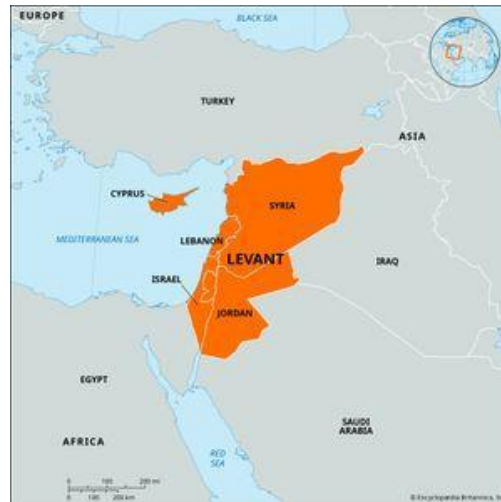
Figure 1. Peta Wilayah Levant

Middle East and Mediterranean regions, they also strengthened economic and diplomatic ties with the Ottoman Empire. 32