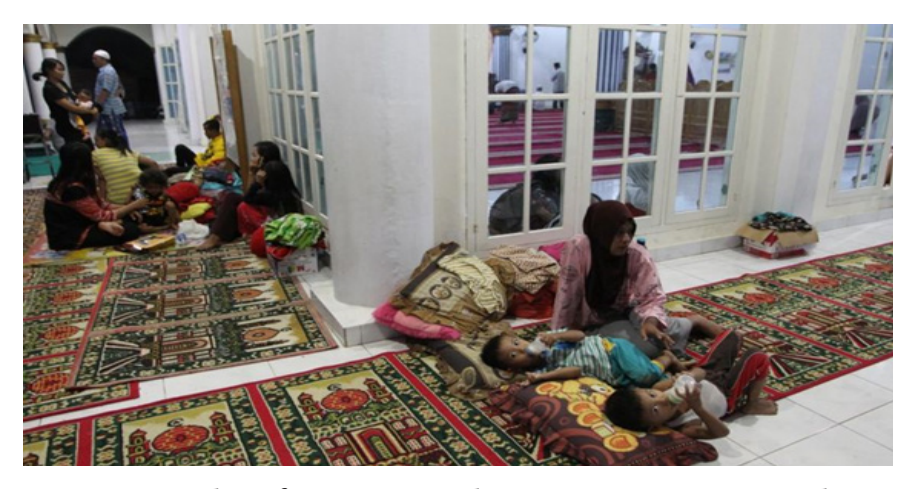
FIGURE 3. The refugees stay at the mosque.

among the mosque administrators because it is not a place for refugees, and they may misbehave later in the mosque. The flood occurs because God is angry with human behavior. Do you want to add to it by polluting the mosque?