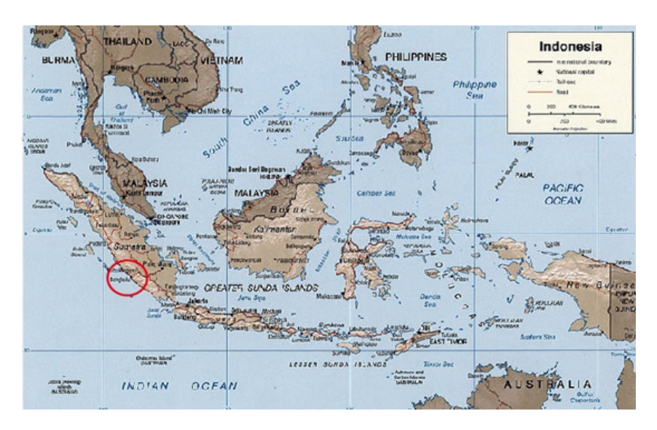
FIGURE 1. Map of Indonesia Indicating the Location of Bengkulu.