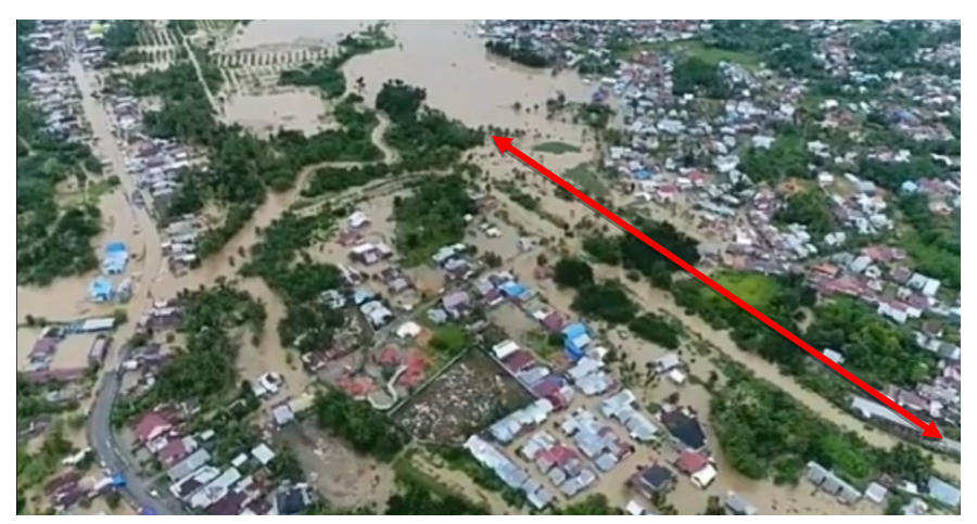
FIGURE 2. Serut river overflows the resident area.

The findings for the first purpose of revealing the perception of mosque administrators towards mosques as emergency shelters were analysed through a series of observations, documentation, and in-depth interview. It rained for 14 hours in all areas of Bengkulu City on 26 - 27 April 2019; from 01.30 p.m. to 03.00 a.m. Rain with moderate to high intensity submerged the city in 28 locations. The flood was the worst one in the last 30 years. Based on our analysis, there were four leading causes of the flood: there was a land alteration around the headwater streams of Serut River, there was narrowing and silting of the river, the road level was higher than the house level, and the region was partly a swamp area. Figure 2 shows the flow of the Serut River that failed to accommodate the water volume that finally flooded the residents' housing.