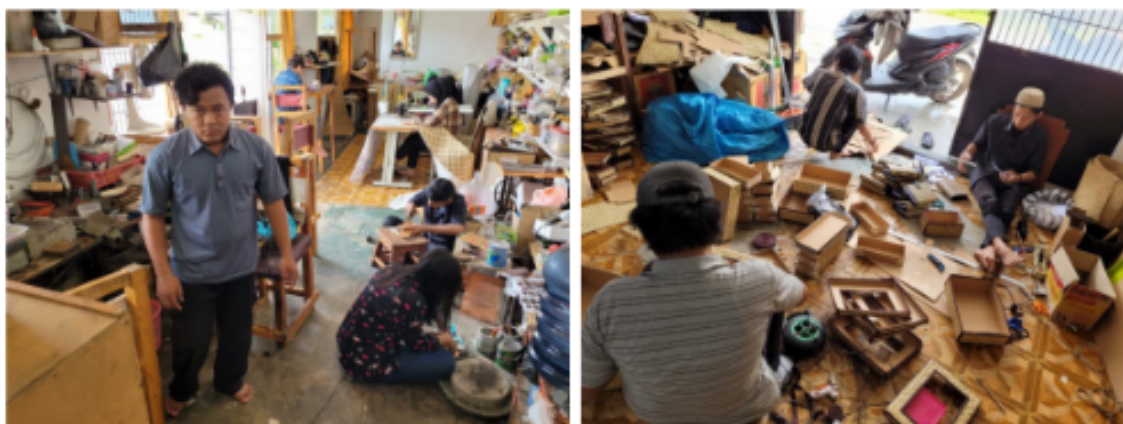
Picture 1. BQC Workers are Making Creative Products from Purun Woven.

catering to the hospitality industry, the diverse product range exemplifies the breadth and depth of offerings.