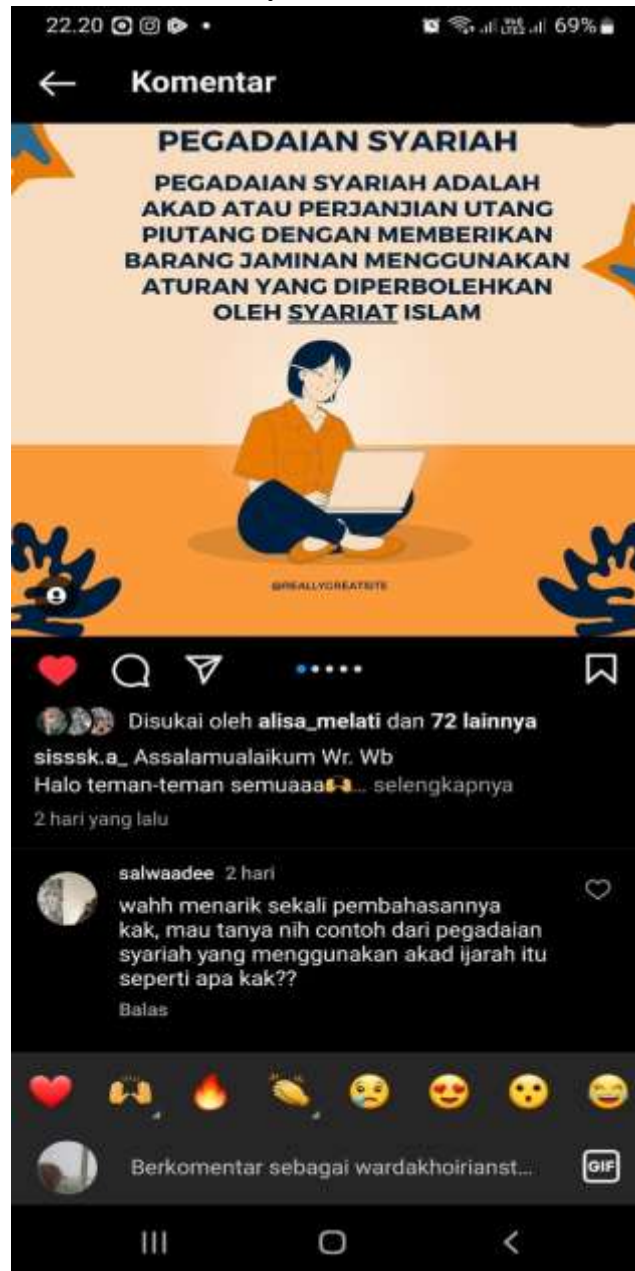
Figure 1 Proof of delivery of material in the form of a post