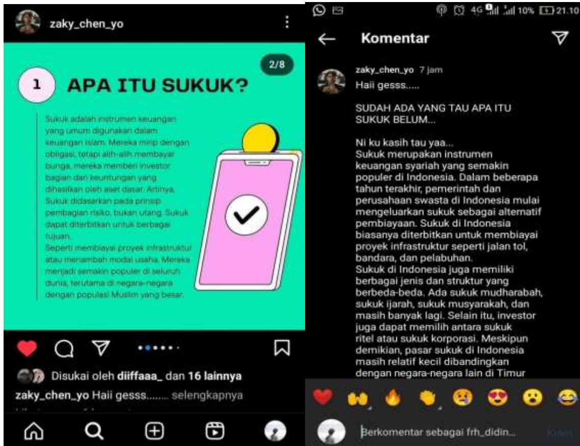
Figure 1 & 2 Photos of IG Feed Posts About Sukuk

From the results of our discussion conducted in the comments column, there are still some people, namely 3 people who are still confused and ask questions about sukuk. However, we answer these questions one by one, so that people can understand sukuk investment in Indonesia.