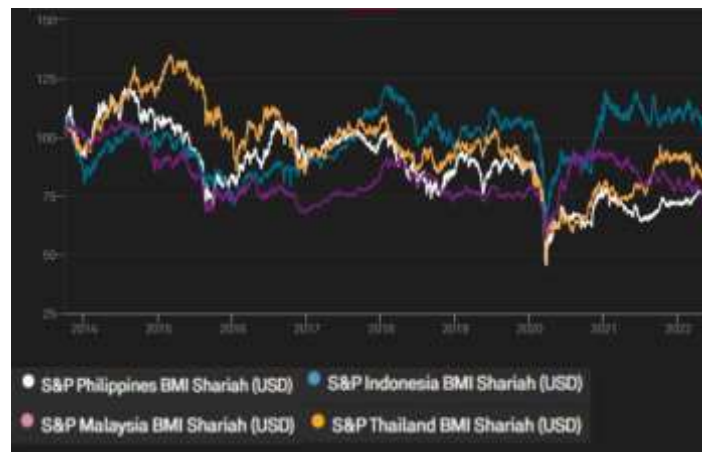
Figure 2. ASEAN-4 National Shariah Stock Index Source. S&P Dow Jones Indices, S&P BMI Shariah

In this era of globalization, the financial industry has developed rapidly, including in ASEAN-4 countries. However, there are concerns over the stability of the conventional financial system which is vulnerable to the risk of a financial crisis. Therefore, Islamic principles-based finance as an alternative is becoming increasingly popular among the public (Benaissa dkk., 2005). According to Mansoor Khan & Ishaq Bhatti (2008) and Alasrag (2010), Islamic finance and its prospects are a viable alternative to the crisis-hit global financial system. Islamic banks have higher profit rates, are less affected by financial crises, and are more stable in the long run than conventional banks.