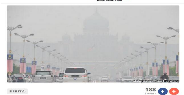
'Bukan surat protes, tapi tawar mahu bantu tangani jerebu'