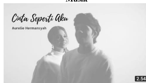
Figure 3. YouTube Channel of Hijau Musik

AURELIE HERMANSYAH - CINTA SEPERTI AKU (Official Music Video)