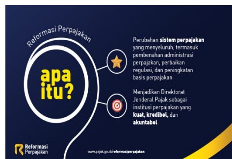
Figure I. Infographics in the Tax Reform Rubric