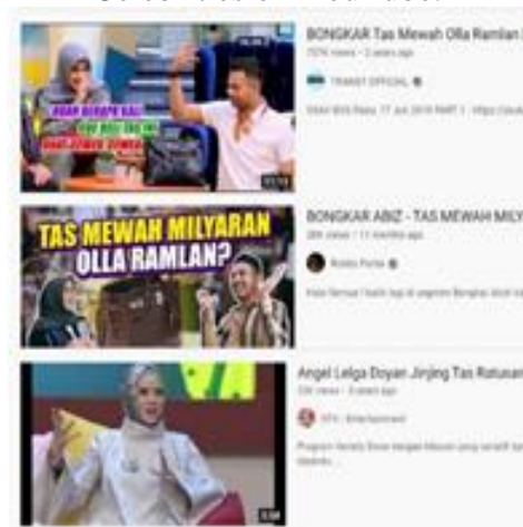
Figure 2. Interview with Muslim Celebrities on YouTube.

The study of syntax focuses on how morphemes and words work together to create sentences and other longer units. Word order, grammatical relationships, and hierarchical sentence structure are among the main syntax issues (Müller, 2023). The sentences are arranged in such a manner that allows the goals and objectives to be achieved (Payuyasa, 2017). Syntaxis analysis in this research includes sentence format, coherence, and pronouns. The table below displays the findings and analysis about syntaxis of the netizens’ comments on the celebrities’ Instagram and YouTube post featuring muslim celebrities wearing wild animals as fashion items.