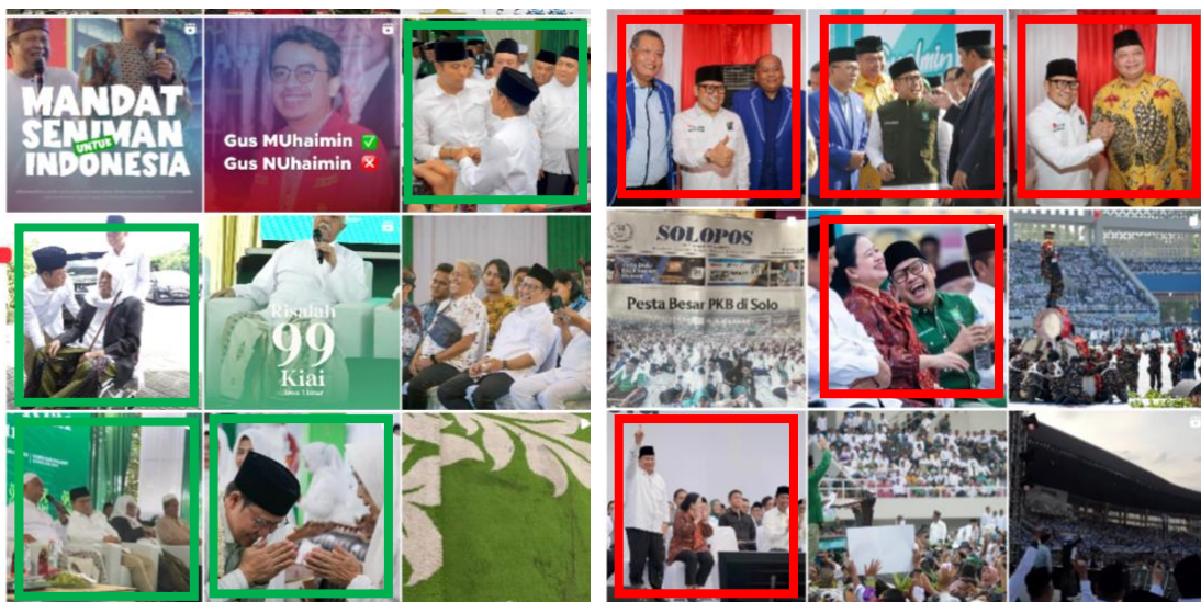
Figure 3. Coding and Noting of images of Gus Muhaimin Iskandar's Instagram

But the shifting of figure appearance in Gus Muhaimin's post came on May till the last of July 2023. The appears of politician are often seen since 29 April 2023, the meeting of Koalisi Kebangkitan Indonesia Raya (KKIR) towards 2024 Election become the stepping stone of this appearance. Gus Muhaimin appeared with Prabowo Subianto in 11 posts since May to July 2023, more than the appearance on January to April 2023 (8 posts). It is related to the political vision that brought by Gus Muhaimin to face the 2024 Election, as the favorite candidate of vice-president, accompanying Prabowo Subianto who stands to be the president candidate. Beside the Prabowo Subianto figure, President Joko Widodo and Airlangga Hartarto become two figures that also often appeared in Gus Muhaimin post (6 posts).