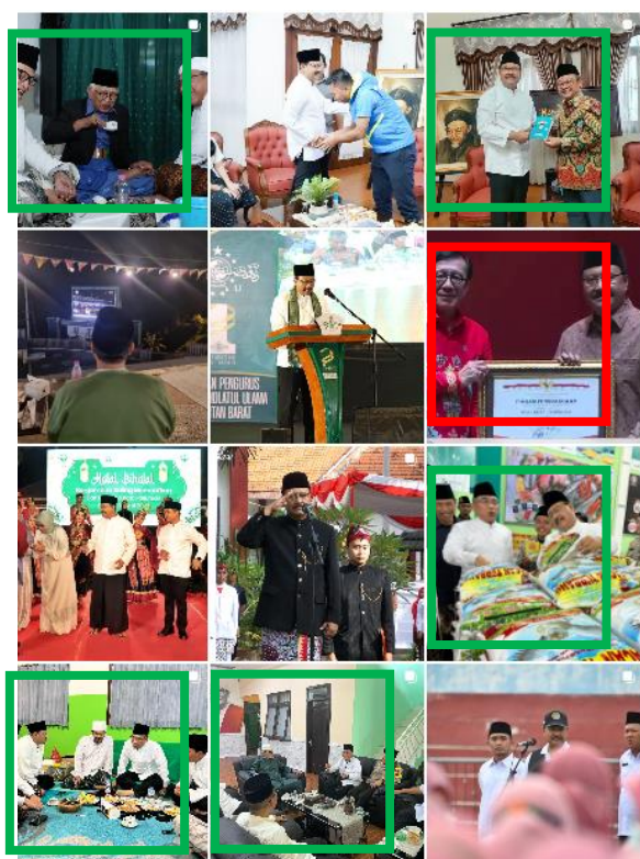
Figure 4. Coding and Noting of images of Gus Saifullah Yusuf's Instagram

The representation of Islamic figures and politicians on Gus Saifullah has appeared in different way. Gus Ipul has a close relationship with Islamic figures since his chair in the government. Now, he holds the position of General Secretary of Nahdlatul Ulama. The picture of Islamic figures in Gus Ipul's Instagram post are dominant. Several Islamic figures who often appeared are Habib Syech bin Abdul Qodir Assegaf and Yahya Cholil Staquf (8 posts). Both are famous Islamic figure in Nahdlatul Ulama community. Habib Syech is the leader of Majelis Ta'lim Ahbaabul Musthofa, getting many supporters that gathers as The Syechermania. Also, Yahya Cholil Staquf is the Chairman of Nahdlatul Ulama. Gus Ipul also portrayed his close relationship on the figure of Khofifah Indar Parawansa, the Governor of East Java.