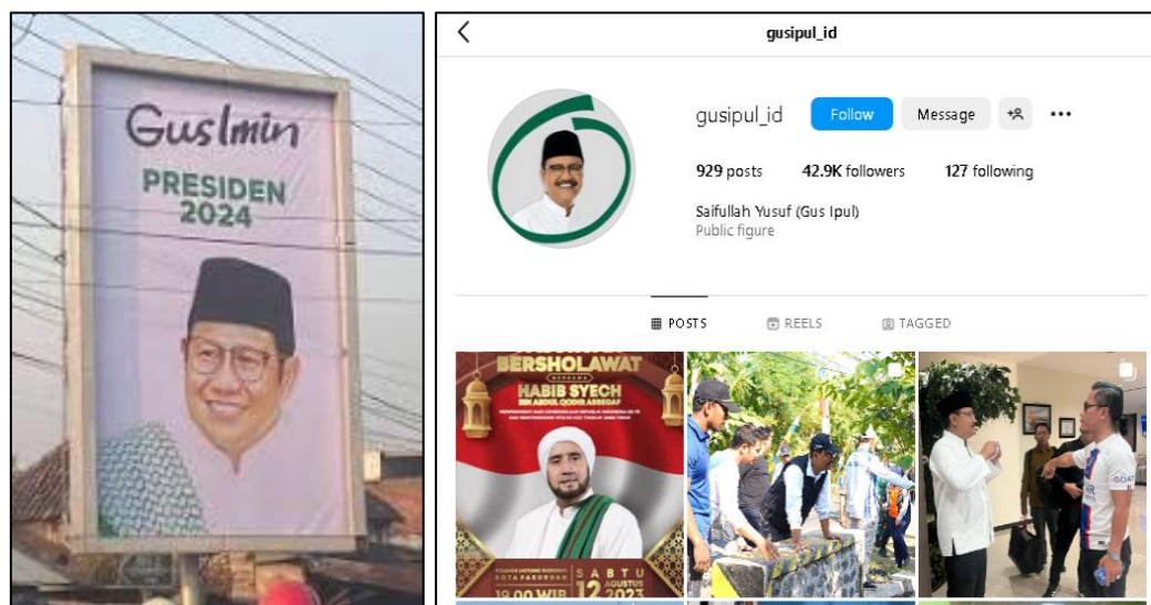
Figure 1. The branding of Gus Imin and Gus Ipul in public sphere and social media