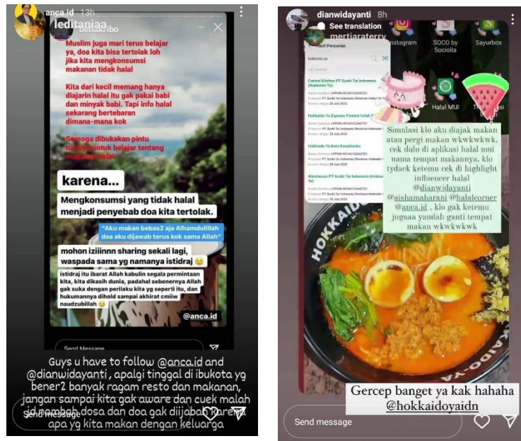
Figure 2. Wholektif Story