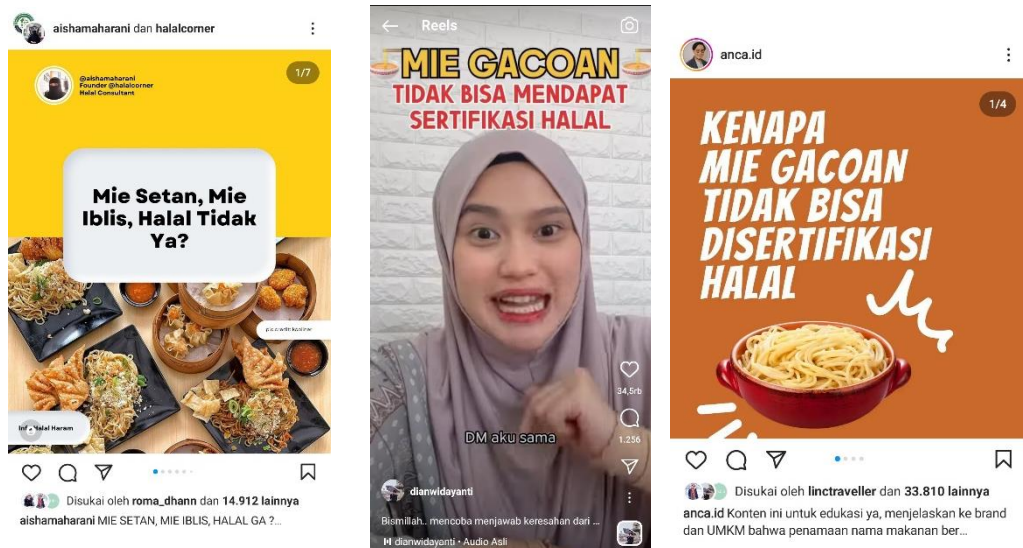
Figure 2. Content about Noodles that went viral among young people "Mie Gacoan"