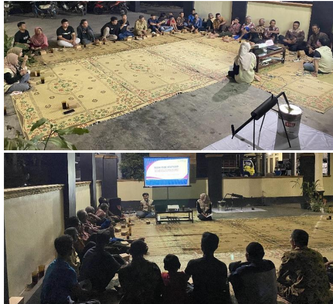
Figure 1. Presentation of Liquid Smoke Socialization Material to Residents of Lobang Hamlet

The first session of the socialization activity began with a presentation of material about the content contained in the feces of quadrupeds, such as nitrogen (N), phosphorus (P), potassium (K) and other nutrients. After that, what impacts can be caused by the accumulation of livestock manure waste and its impact on humans, animals and the environment are discussed. This certainly has a bad impact on health, the quality of the air inhaled, the quality of the environment, and its impact on the ecosystem. After the provision of material by the research team, it was then continued with a demonstration or practice of using tools to obtain liquid smoke.