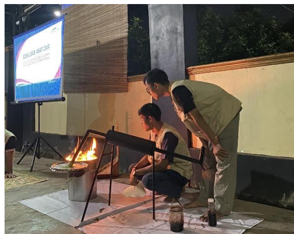
Figure 2. Liquid Smoke Making Practice Activities

In the second session, Figure 2 shows the demonstration team practicing how to make and obtain liquid smoke to remove the smell of four-legged livestock waste. The trainees looked more enthusiastic at this stage because they were curious about how to obtain the liquid smoke and were interested in seeing it firsthand.