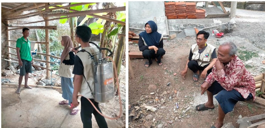
Figure 5. Interview Process Regarding Residents' Responses to Liquid Smoke Socialization

livestock manure becomes much reduced. Thus, the socialization of liquid smoke to remove the smell of four-legged livestock manure can be said to be successful in achieving the targeted goals.