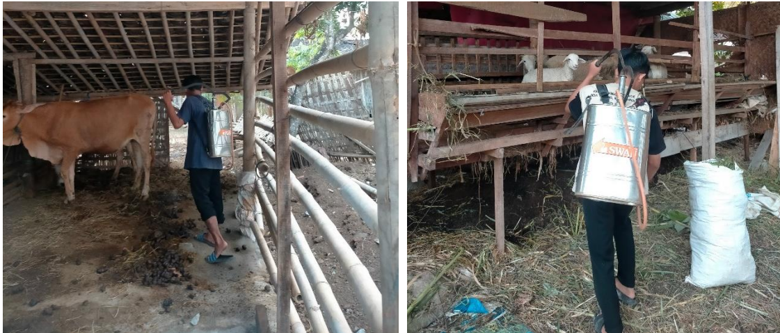
Figure 3. The process of spraying liquid smoke liquid into residents' livestock cages

The next day, the research team sprayed directly to five livestock cages of local residents as part of the coaching. Spraying is done once per week on each drum, as shown in Figure 3. At the end of the spraying session, the research team also conducted direct interviews with livestock pen owners to find out the effectiveness of liquid smoke in reducing the smell of four-legged livestock waste. As a result, the five farmers stated that although the unpleasant smell from the manure was reduced, the process did not occur directly but gradually. Until the last spraying, the smell of feces was not as pronounced as usual.