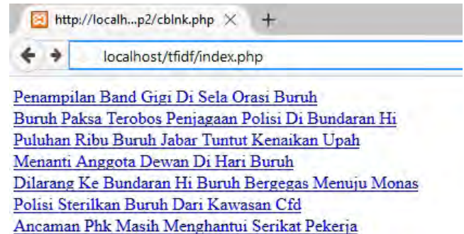
Figure 3 Execution result of index.php .

href=\"bcurl.php?urlnya=$urlberita\">\".$jdl."</a> Reviews"); . Here are the results of execution url index.php which displays the message for processing.