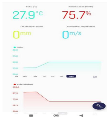
Figure 3. The display at Blynk application

The weather monitoring system software was successfully developed using the Arduino IDE and the Blynk IoT application. The interface was built using the Blynk application, which is integrated with the system program created in the Arduino IDE. The interface display on the Blynk application is shown in Figure 3.