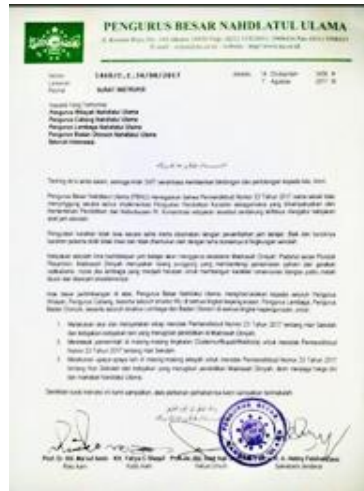
Figure 4. PBNU's instructions to PWNU, PCNU and Banom Institution Tools to Refuse FDS

It is interesting to discuss the terminology of jihad in the rejection of full-day school policy. Because it is very rarely used by pesantren . Especially considering the terminology of jihad has been so damaged by fundamentalist groups. This means that the pesantren is not easy to sell the terminology of jihad. Jihad is a sacred terminology. It must not be used carelessly. If the pesantren uses it, then the scale or event that is fought is not an ordinary event. From this, we can conclude that the rejection of the five-day school or full-day school policy is conceptualized as defending religion. 31