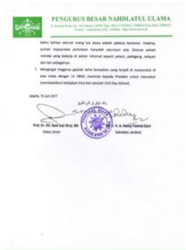
Figure 3. Press Release of PBNU rejecting Full Day School

On July 7, 2017, or about a month after that, the PBNU issued another press release. The release explicitly states that the five-day school policy must be stopped. Interestingly, on August 7, 2017 PBNU issued an instruction letter concerning the rejection to the entire board of NU starting from the Central level, the Region to the Branches to the grassroots level. This instruction led to a series of rally and also the refusal for rejection. It became increasingly apparent. The unique form of rejection is through social media. The official accounts of the Nahdlatul Ulama and also the NU community on Twitter are busy using the #JihadTolakFDS hashtag. This wave of rejection is very massive; even the hashtag became a trending topic for more than 18 hours. 30