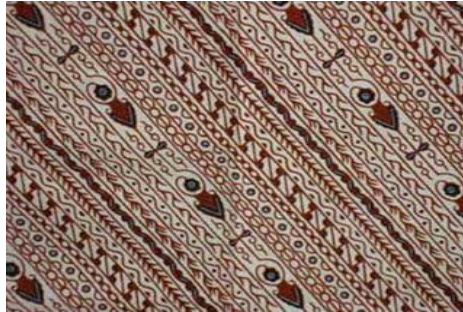
Motif Batik Parikesit

between humans and nature, humans and humans and humans and their Lord. The diagonal lines contained in the Parang batik motif, illustrate that humans must have lofty ideals, be solid in their convictions, and be faithful to the value of truth. The dynamics in this machete pattern are also called dexterity, alertness, and the constituency of one another.