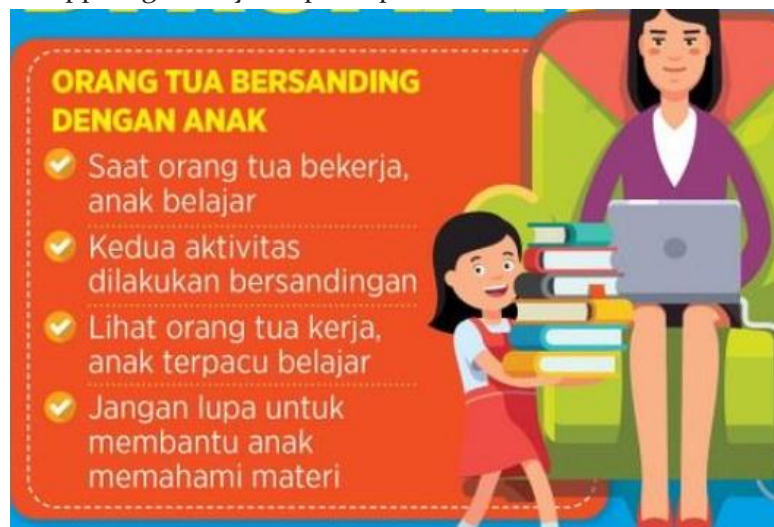
Figure 2. Tips for children to feel at home learning

In addition, the principal also appealed to parents or guardians of students to accompany students in the process of online learning activities at their respective homes. Some of the suggestions recommended by the principal were tips so that students were not bored in the learning process at home. Moreover, many of the parents are working. The jobs of parents of students vary, ranging from housewives, shopkeepers, garment workers, factory workers and entrepreneurs. In general, the appeal given by the principal is as follows: