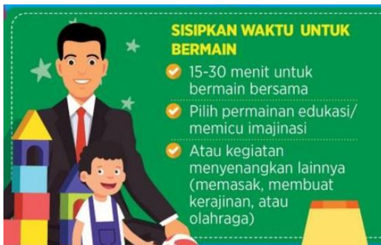
Figure 3. Tips for children to feel at home learning

is from the family. The role of this family is the spearhead of the success of students. 15 Thus, the principal hopes that online learning will be able to train collaboration so that the vision of the school and family is the same. The principal also recommends parents to organize students' time at home. Learning time and playing time are momentum that students must have so that they do not get bored during the learning process at home only. For more detail, it can be seen in Figure 2 about the division of time for students.