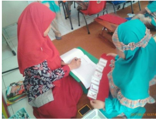
Figure 1. A Child Clinging to an Alphabet Box

and continued by giving a set of alphabet boxes to the child which were placed in the big box. After that, the mother of the teacher continues by asking the child to look for letters that can form words as exemplified on the blackboard, for example Umrah. So the child looks for the letters UMRAH.