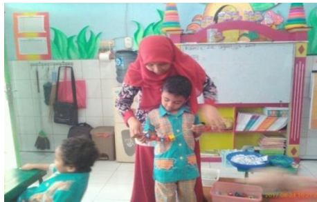
Figure. 3 Children Presenting Their Work

they form the word ihrom correctly and not be reversed using shoelaces. After the children succeeded in rapping the blocks with shoelaces, they were asked to come forward presenting their work.