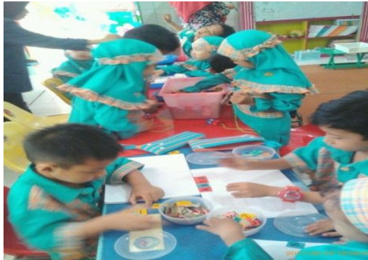
Figure 2. Children Assembling Alphabet Box