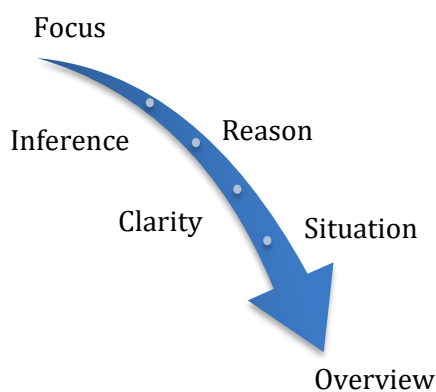
Figure 1. Critical Thinking Stage

There are at least four basic abilities to stimulate 21st-century abilities so that children can face the era of disruption in the 21 st century, including critical thinking skills, creative thinking, communication skills, and collaboration skills (Redhana, 2019). These four basic abilities are often referred to as 4Cs skills in the 21 st century (Ariyana, Pudjiastuti, Bestary, & Zamroni, n.d.). First , critical thinking can interpret results and evaluate professional and active observation, communication, information, and argumentation (Fisher, 2001). Critical thinking can be interpreted as reasoning related to beliefs or behavior (Ennis, 1996). Critical thinking can be used as the basis or foundation for humans to develop themselves through learning, training, and various learning methods in critical thinking conditions and stages (J.L & Meredith, 2011). Critical thinking can be done by analyzing similarities and differences by observing and identifying causes and effects (Florea & Hurjui, 2015). Here are the stages of critical thinking (Arends, 2012).