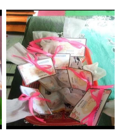
Figure 6. Documentation of Types of PAUD IT ADAR Souvenirs