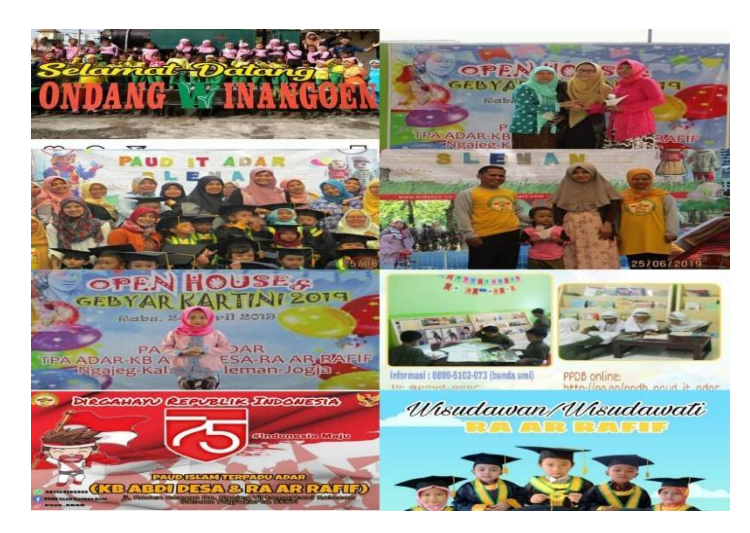
Figure 2. Documentation of School Events

The picture above shows that the event held by the school is one of the leading programs to attract the interest of parents and the surrounding community. In the picture above, it can be seen that the significant events carried out by the school are a form of institutional seriousness in maintaining quality as well as being one of the strategies used by schools in recruiting as well as promotional events as a strategy for accepting new students.