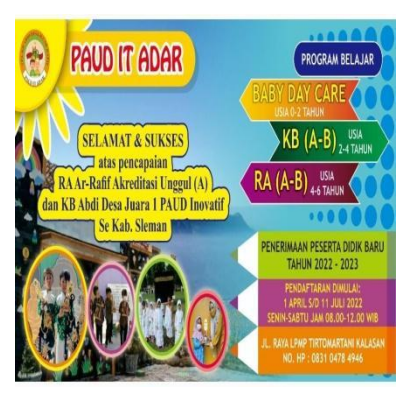
Figure 4. Documentation of Installing New Student Acceptance Banners

The figure 4 were a banner design made by the PAUD IT ADAR. The banner is one of the school's strategies in recruiting new students, displaying some documentation of championship activities and events that are the most interesting and quality.