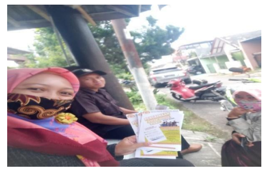
Figure 3. Documentation of Brochure Distribution with Teamwork

The natural environment described in this fairy tale is a forest on the island of Sumatra. The forest Forming teamwork is one of the strategies for accepting new students in schools. It is done to make it easier for teachers to distribute flyers for accepting new students. This teamwork consists of groups of several teachers who are broken down into groups of three to four teachers. Forming a team work as a form of the school's seriousness in managing strategies for accepting new students due to good environmental conditions and entering the new normal era. For this reason, brochure distribution can be carried out optimally from house to house to reach from village to village.