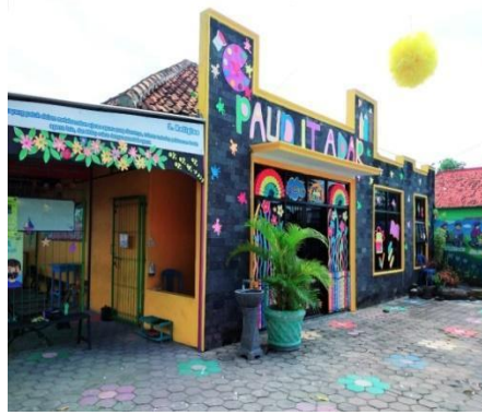
Figure 5. Documentation of Modernization Activities infrastructure facilities

The figure 5 shows that updating activities to be better than before must be carried out. In addition to creating a comfortable school atmosphere, it can also make an ordinary school look new. The picture above also shows that modifications to school infrastructure will look better and more modern.