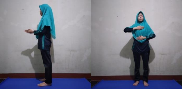
Figure 5. Qiyam Movement II (Stand Up)

In the Qiyam II movement, the way to do it is to take a standing position with both feet in line with the shoulders. Rub both palms in front of the stomach, inhaling through the nose. Place the right hand on the chest and the left on the stomach—Exhale from the mouth, making a "hi" sound (5x repetitions).