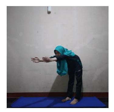
Figure 6. Rukuk Movement I (Bowing)

In the first bowing movement, the way to do it is by bending the body forward by pulling the hands forward and inhaling from the nose. Then pull the body to an upright position, and exhale from the mouth with a 'hu' sound (5x repetitions).