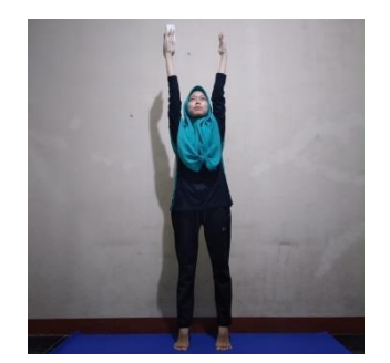
Figure 4. Qiyam Movement I (Stand Up)