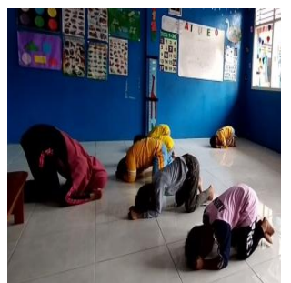
Figure 11. Sujud Movement II