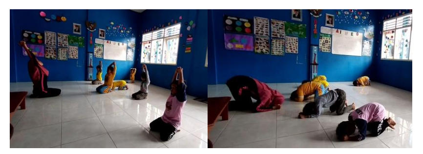
Figure 2. Limited Trial