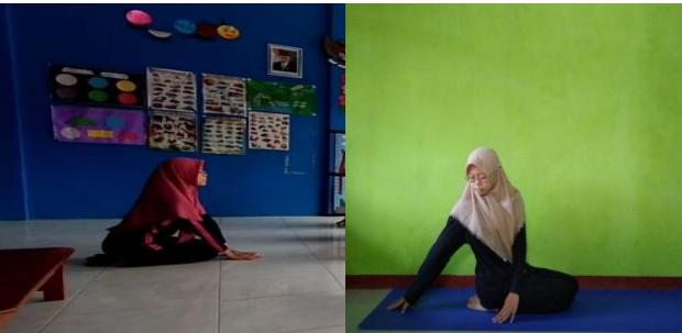
Figure 9. Julus Movement II (Sitting)

In the julus II movement, the way to do it is the sitting position is still the same, place the hands in front of the knees, then pull the hands slowly to the right back and alternately pull to the left back accompanied by inhaling from the nose and exhale from the mouth with the sound 'ha.' (5x repetitions).