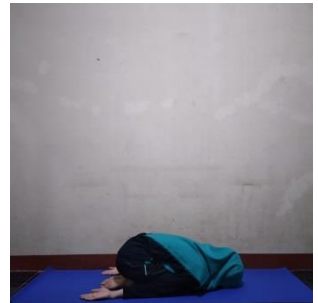
Figure 10. Sujud Movement I

In the relaxation stage, lie down on the floor, feet shoulder-width apart, hands by your sides, and palms facing up. Close your eyes and relax your muscles from head to toe. Once you feel relaxed, release negative energy and inject positive energy into your body. It can be done by giving positive affirmations, such as I am an intelligent child, study hard. I am a pious child. I am obedient to my parents. (+- 2 minutes), can be interspersed with inhaling from the nose and out from the mouth with a 'ha' sound.