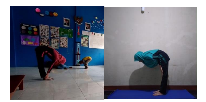
Figure 7. Rukuk Movement II (Bowing II)