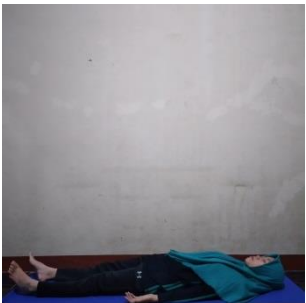
Figure 12. Relaxation