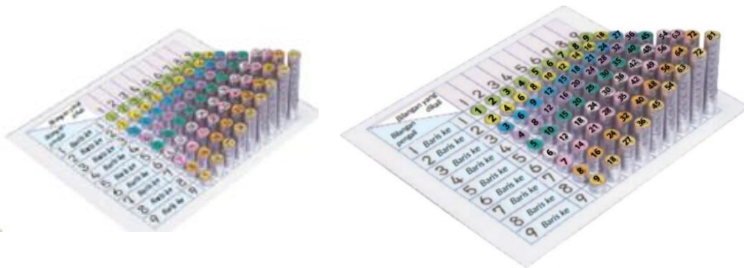
Figure 2a. Multiplication table before revision with a blurry image, and Figure 2b . after revision with a clearer image

Revisions from media experts include layout, revised images with better resolution, and the addition of a bibliography. One of the revisions made can be seen in Figure 2.