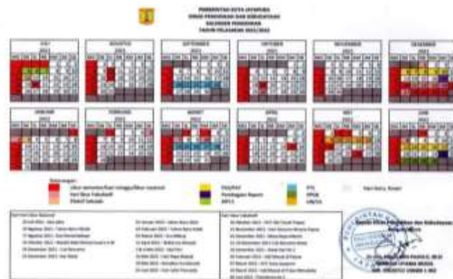
Figure 1: Education calendar in Jayapura

Compare with the education calendar in Yogyakarta: