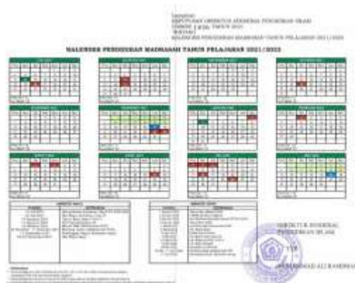
figure 2. Education calendar in Yogyakarta

Compare with the education calendar in Yogyakarta: