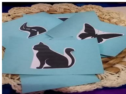
Figure 1. Pictorial Card

The syntax is one of the exciting discussions in linguistics. The syntax is a language element that focuses on the word-to-word relationship or other elements of a speech (Chaer, 2003; McGregor et al., 2012; Zaharchuk & Karuza, 2021). Therefore, syntax needs to be taught from an early age. Based on results observation, HN shows the ability to communicate well and smoothly in daily life. HN also has interest in media that can be visualized, such as images. However, HN still experiencing difficulty in reciting a number of letters like the letter 'L' still can be swapped and heard like the letter 'W'.