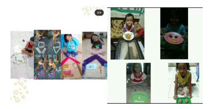
Figure 6. Material development on the theme of my environment