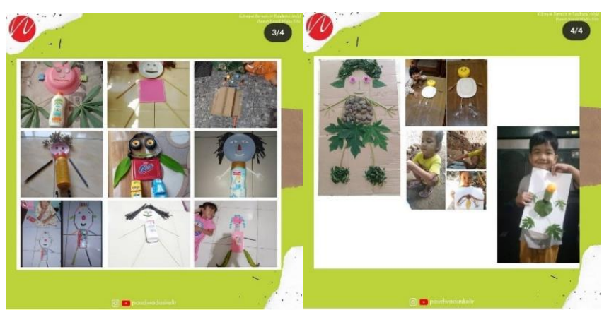
Figure 1. Development of loose part materials in learning the theme of my body

The loose part material development process carried out by the teacher is material evaluation. The teacher evaluates the material by looking at the results of children's work and aspects of child development that have been previously determined. If the work of children and the achievement of children's development is excellent and pleasing and there are no problems, the selection of materials can be categorized accordingly. When the development of the material is not following the intended purpose or the material used turns out to be harmful to the child, the material will not be reused in the following learning process. For example, the use of chili as a loose part material, if after learning the child feels the heat in his hand, the teacher will not use chili again as a medium, or the teacher will be more careful in giving instructions regarding the use of the material.