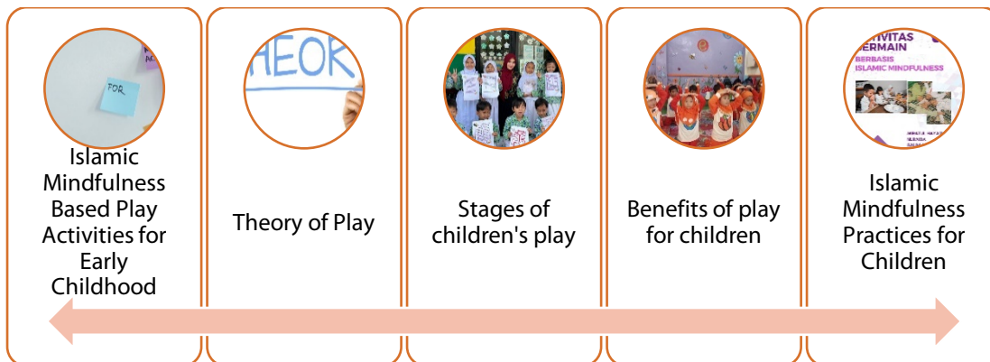
Figure 2. Physical model flow

The physical model is depicted in the following flow: