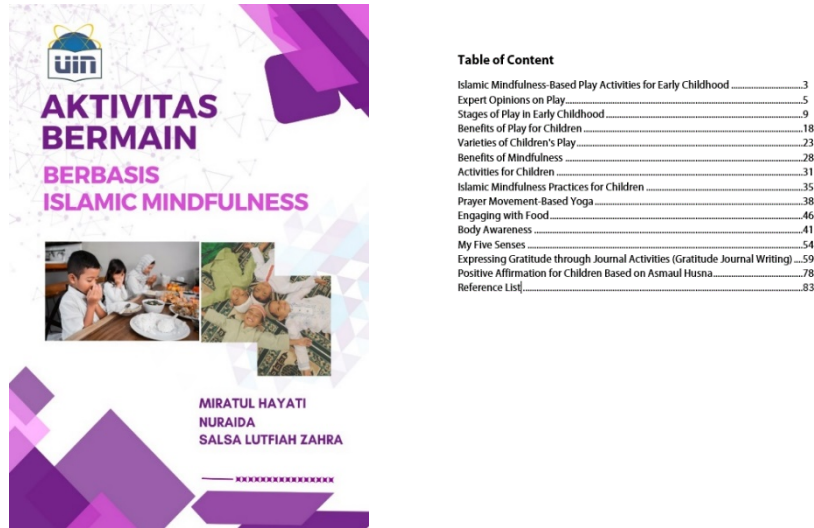
Figure 1. Cover and Table of Contents of the Book "Islamic Mindfulness-Based Play Activity"

The design model in this study is a physical model in the form of an Islamic mindfulness-based play activity guide for teachers in designing and implementing play activities for children. The developed play activities consist of 14 chapters in the book.