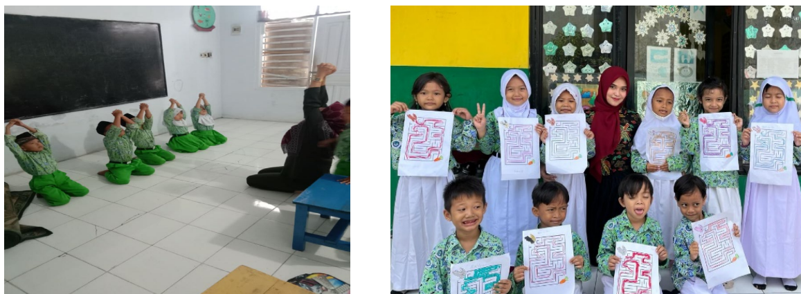
Figure 3. Field Trial at TK A

The play activities have been a trial for 20 children in several schools in Depok and Jakarta.