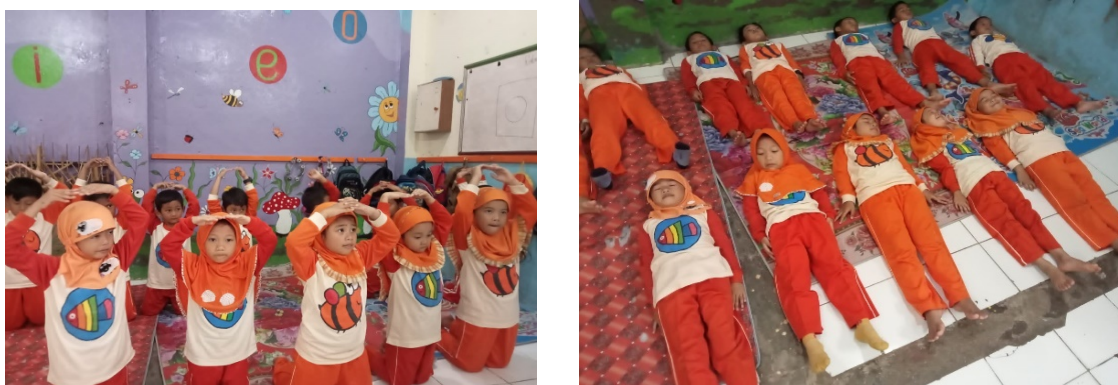
Figure 3. Field Trial at TK B

The qualitative results of the children's studies showed that children enjoy play activities based on Islamic mindfulness. As expressed by SZ, "I am happy, teacher," the same was conveyed by S, "I'm happy too, ma'am."