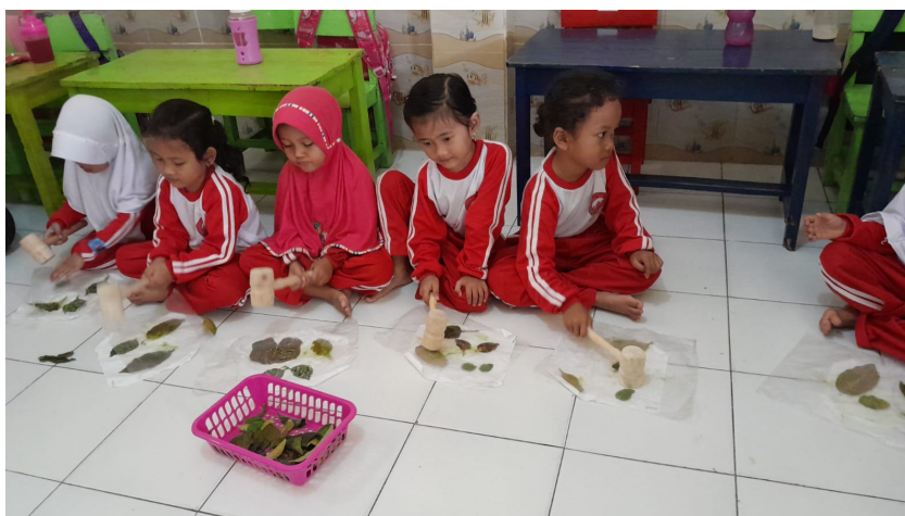
Figure 4. Ecoprint Activities on Fabric Using Pounding Technique

In the Discovery phase, children learn that not all green leaves produce the same color, and the same applies to flowers. They discover, for example, that guava leaves turn brown when pressed onto paper and teak leaves turn purple, even though both are originally green. Similarly, they find that the yellow cosmos flowers turn orange upon pressing, the pink periwinkle flowers turn purple, and the white ones turn brown when pressed.