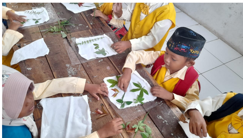
Figure 5. Application Stage of Eco-print Project Design

Children move on to the Application phase following the Reflection, Research, and Discovery stages. Here, they start their eco-print project on fabric materials, still employing the same technique. Children apply leaves and flowers as desired to achieve the product design they envision.