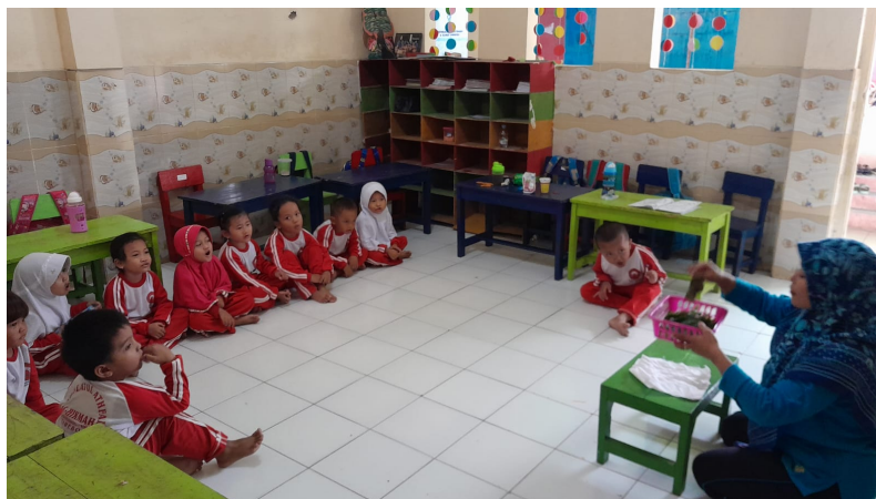
Figure 3. Teachers as facilitators when posing stimulating questions

Teachers play a role as facilitators in the ecoprint project conducted by children. As depicted in Figure 3, teachers can pose stimulating questions, such as inquiring about the types of leaves collected. Other questions to elicit children's knowledge can also be introduced at this stage.