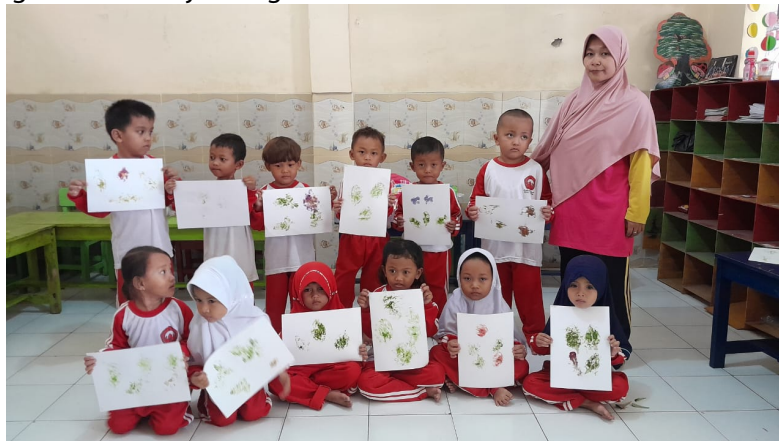
Figure 2. First Ecoprint Activity on Paper with Pounding Technique

The Ecoprint project followed the STEAM PjBL stages from Reflection, Research, Discovery, and Application to Communication. The Ecoprint Project involved batik activities using natural materials like leaves and flowers for patterns. The ecoprint activity was carried out in three sessions: Ecoprint on Paper using the pounding technique, the ecoprint on fabric with the pounding technique, and the ecoprint on fabric using the steam technique. Observations were made, and descriptive data about the activity's execution were collected. Each activity was conducted following the STEAM PjBL stages.