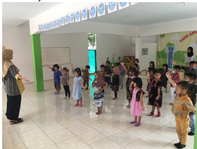
Figure 2. Documentation of Activities: Dance Art Activities

Creative dance, such as the "Tari Lilin" (Candle Dance), is simplified for easy engagement, ensuring children can comfortably follow the movements and music.