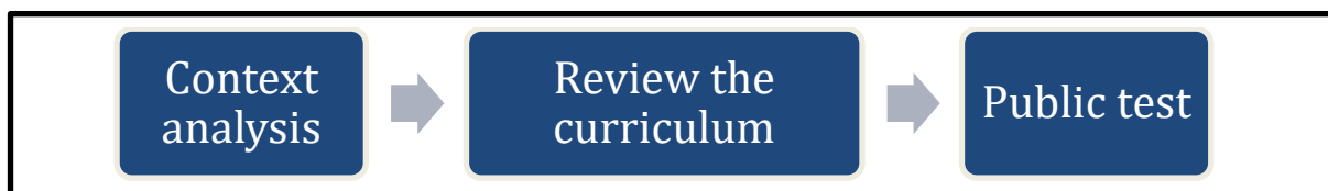
Chart 1. Curriculum preparation process School Level

First, analyze the context. The curriculum development team will investigate the school regarding the madrasa's strengths ( strengths ), weaknesses ( weaknesses ), opportunities ( opportunities ), and threats ( threats ), better known as the SWOT analysis approach. The SWOT analysis used by MAN 2 Bantul was to determine the madrasah's strengths and weaknesses. The analysis results are used to determine the programs that will be implemented. The curriculum development team consists of the head of the madrasah, the deputy head of the madrasah, a committee, and several teacher representatives.