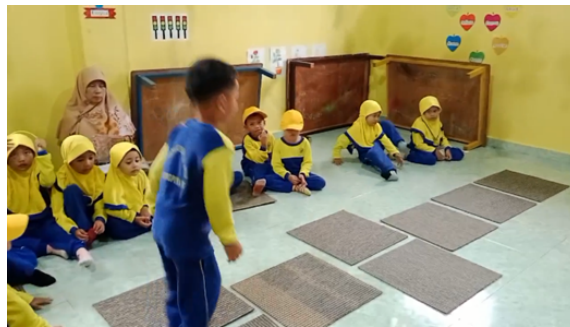
Picture 2. Early childhood playing “Engklek” at RA Al-Amin Tanjungpinang

At RA Al-Amin, 67% of children were able to name traditional games well, and 60% showed interest in trying the game. In explaining the rules of the game, most children began to understand, but some still needed guidance. The level of participation and interest was quite high, with many children actively participating in activities in the module.