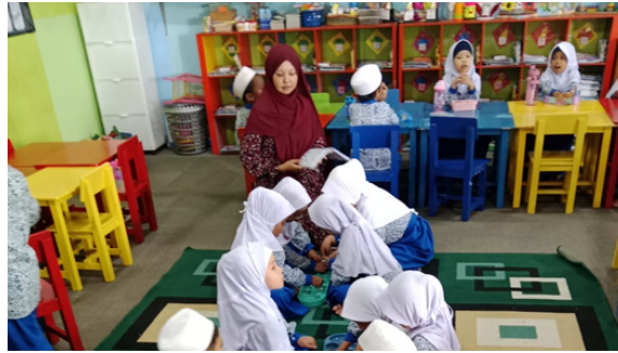
Picture 1. Early childhood playing “Congklak” at TK Ash Shalihah Tanjungpinang

have succeeded in imitating the game movements. Aspects that still need strengthening are the understanding of the rules of the game which are only understood by some children.