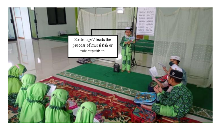
Figure 3. Observation Result of How Students Lead Learning

In Figure 3 below, a 7-year-old child dares to lead the class. There are other students who are older than him, some are smarter than him, but he is still confident and able to do his job well. Good collaboration is carried out by other students where they respect the leader and follow closely even though the leader is younger than them.