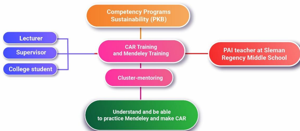
Figure 1. Implementation of PTK Training and Mendeley Training on Competency Programs Sustainability (CPS)

The participants' enthusiasm and eagerness to participate in PTK and Mendeley Training can be measured through the presence of teachers in advanced training. Participants could attend and join the training at the right time despite their busy teaching schedules or other educational operational duties. The participants showed calm attitudes and followed the instructions or directions given by the mentor teacher. Another reason behind the participants' enthusiasm for advanced training was that all of them could figure out and recognize the competencies of the presenter, namely the presenter's ability in training methods or theories. Based on the above-presented training process and results, it can be summarized in the following figure: