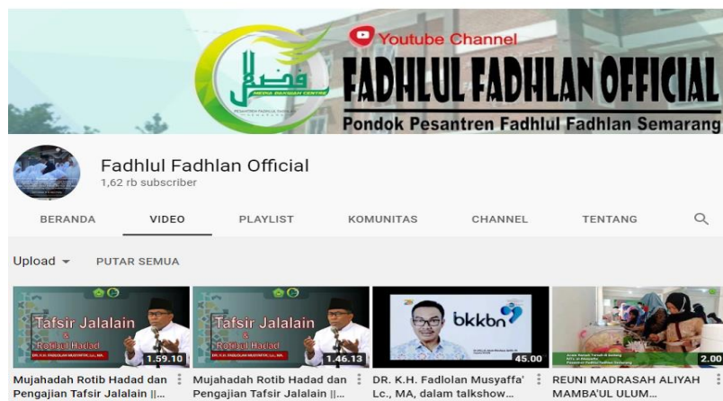
Image 2. Pesantren Fadhlul Fadhlun's YouTube Platform (Documentation, 2022)

Kiai's advice conveyed in the recitation can also be recalled by opening Pesantren's YouTube and official website. They are a means of the pesantren development program to accommodate pesantren da'wah in deradicalization efforts can expand.