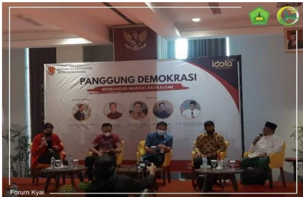
Image 1. Seminar on Nationality seminar with the theme “Stage of Democracy” (Documentation, 2021)

and YouTube channels. Likewise, if the students can't join it offline, they can still listen to it online. The recitation conducted by Kiai inside and outside pesantren seems to synergize and collaborate (Observation, 2022).