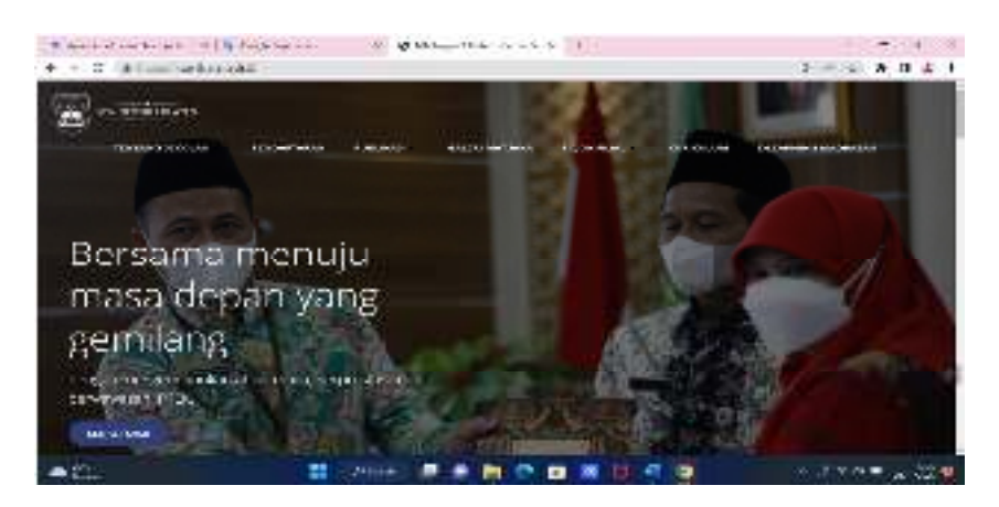
Figure 1. Web Display

The main page (homepage) displayed on the MTsN 1 Klaten website and several other pages are as follows; 1. Main page display (Figure 1). 2. Madrasa activity documents (Figure 2). 3. Videos with social media/youtube links. 4. Web with social media / Instagram links. 5. website for e-learning.