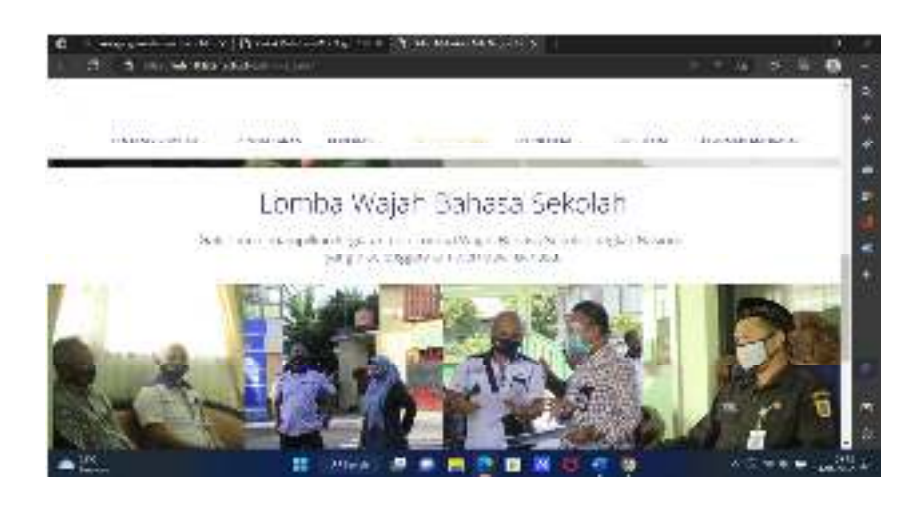
Figure 2. The Web was used in the Indonesian language contest