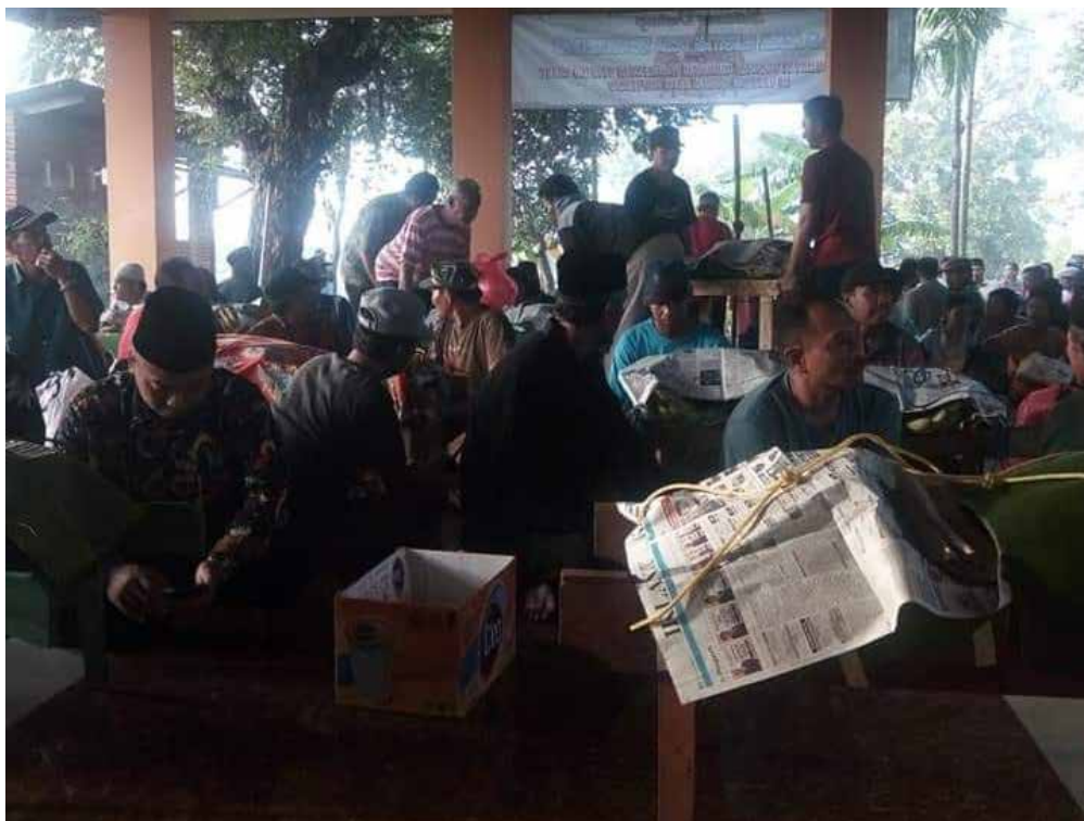
Figure 3: Wedoroklurak villagers and The Ancak Tradition

During this period, the application of the Ancak tradition was more coordinated. Every family must attend and participate in this activity. It aims to keep the Ancak tradition sustainable. What happens is that community