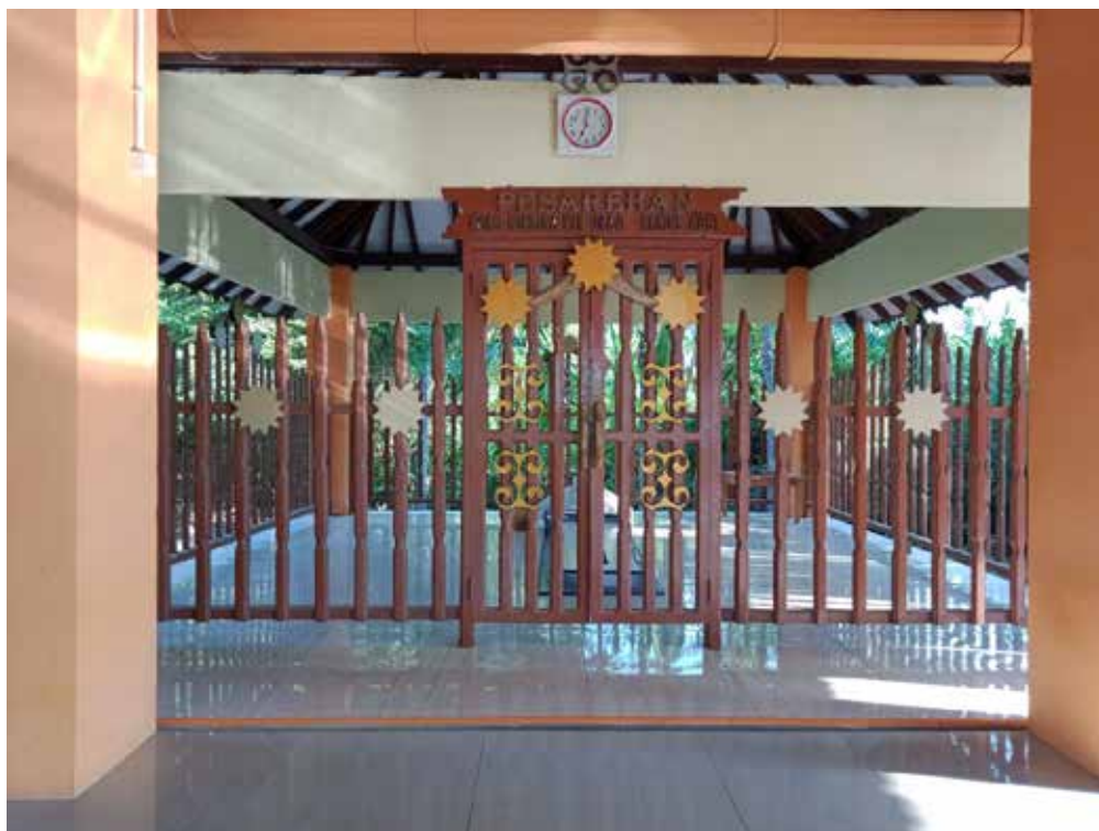
Figure 2: The grave of Mbah Nursinah Kik Graji

The Ruwatan tradition in this village is in the form of alms. Remember that the majority of the population at that time were farmers, so alms were taken from agricultural products, in the form of rice cones added with side dishes